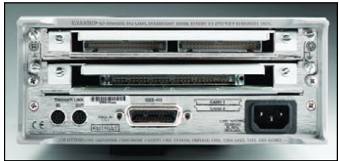
7002-HD rear panel shown with 7002-HD-MTX1 and 7002-HD-MUX1 cards installed.