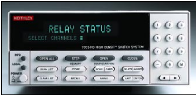
7002-HD Front panel